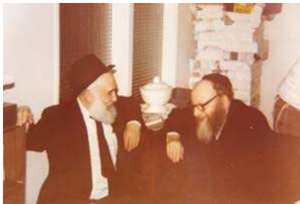
R' Leib Bakst zatzal (Left) with Rav Shneur Kotler zatzal.