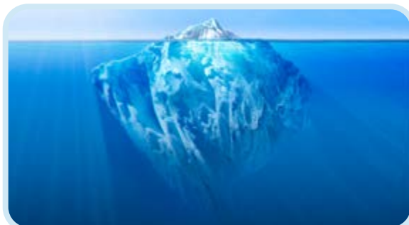
The tip of the iceberg!

This works well for areas of the ocean near land that is warm enough to have free flowing water and rivers. Near the north and south pole however, there are areas that are so cold there is no flowing water and no way for rivers to supply them with their nutritional needs.