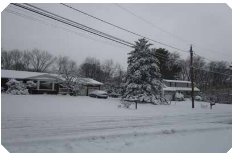
Hashem's beautiful snow last week in Chestnut Ridge, New York.

After davening, I saw on my phone a missed call. The person had the perfect apartment! It was a great deal, and it worked out amazing!" [Kav Hashgacha Pratis]