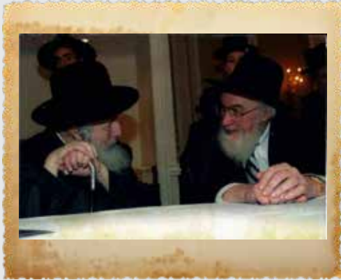
Bluzhver Rebbe with Rav Yisrael Belsky zatzal