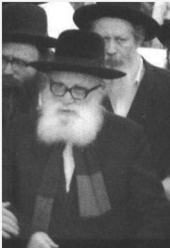
Rav Simcha Bunim Alter, the Lev Simcha of Ger

We see from this story the sensitivity that tzaddikim had for all of Hashem's creations, even the birds on the roof.