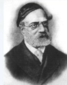
Rabbi Shamshon Rephael Hirsch

When Rav Shamshon Rephael Hirsch was appointed the rav of Frankfurt am Main in 1851, the community, following accepted practice of that time, paid Rav Hirsch his salary at the beginning of every three months, for the coming three months. In his later years, Rav Hirsch was very concerned with the payment arrangement that he had with the community. He was worried that since he gets paid in advance every three months, when he dies, he will really have been paid for work that he never did. He repeatedly reminded his family that when he passes away, they should return the extra money which did not belong to him. In a sign of Hashgocha Protis, Hashem took Rav Hirsch's holy neshama away on December 31, 1888.