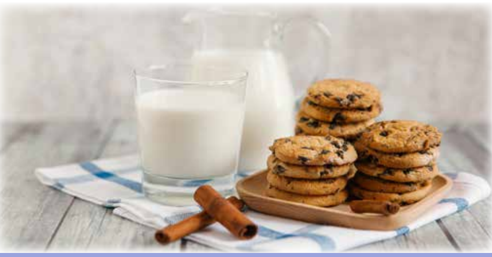
Chocolate chip cookies and milk! Yum!! But only a mashol of a mashol of what's waiting for you in Olam Haba! Keep on stuffing your suitcases with more and more mitzvos!

there is a sign that somebody found money and whoever lost any money should please call the number written on the paper.