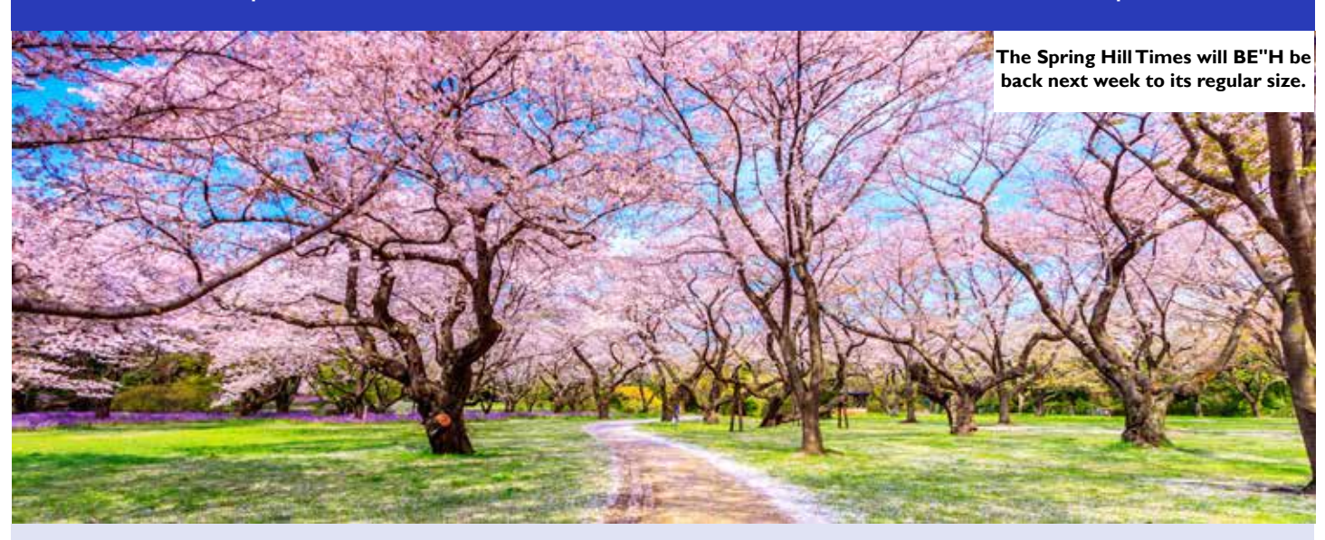
We are so happy in Your beautiful world! We love You Hashem!

ISSUE 95 | TAZRIA, METZORA - SHABBOS ROSH CHODESH | IYUR 5783