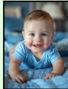
THE BABY'S MIRACULOUS RECOVERY - PAGE 34