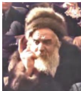
The Munkatcher Rebbe