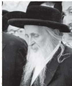
The Satmar Rebbe

not die, and Rashi says: מְקַלֵּל לְאוֹ אֶתָּה we infer that if you don't listen, you will die. The Torah assumes that you'll do things right, but if not, Chas V'shalom , then there will be consequences, Chas V'shalom . וגילו ברעדה Rejoice with trembling! ***